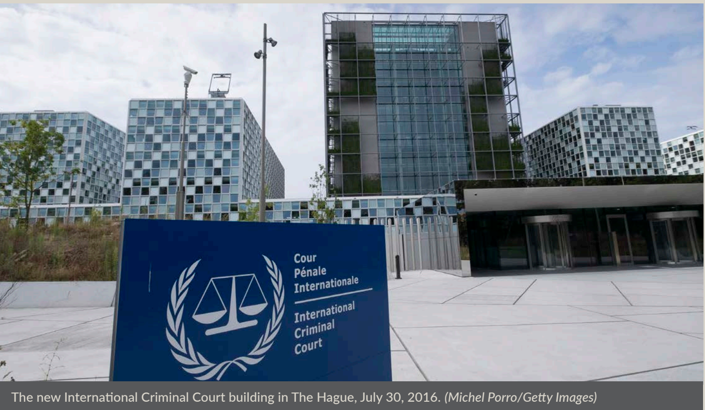
The new International Criminal Court building in The Hague, July 30, 2016.

thousands of foot soldiers of ISIS," as in this case. Furthermore, neither Iraq nor Syria are members of the ICC and therefore the ICC does not have jurisdiction over crimes committed in those countries, making it virtually impossible to pursue this avenue. 17