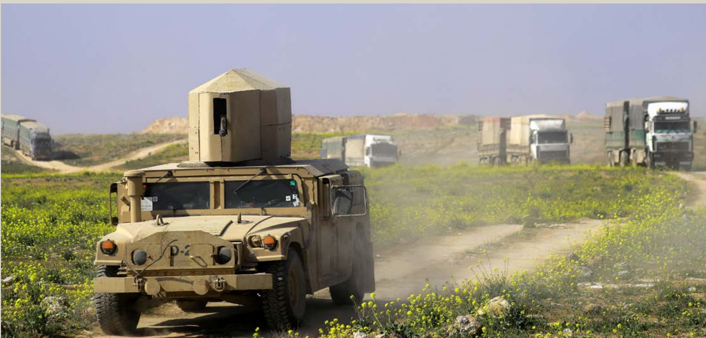
Members of the Kurdish-led SDF escort trucks carrying men, identified as ISIS fighters, out of ISIS's last holdout of Baghouz in Syria's Deir Ez-Zor Province, on February 20, 2019. The implosion of the jihadist proto-state has left Western nations grappling with how to handle citizens who left to join ISIS.

The bottom line is the SDF cannot remedy this problem alone, and with the United States planning to significantly draw down its presence and coalition partners so far refusing to offset the drawdown, it's a problem we need to come to grips with immediately. Were we really expecting a non-state actor proxy force to have the capacity to detain, try, and carry out