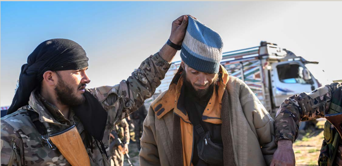
A member of the SDF raises the hood of a Bosnian man suspected of being an ISIS fighter as he is searched after leaving the group's last holdout of Baghouz, on March 1, 2019.

cut during the battle for Raqqa and, more recently, when it released nearly 300 local Syrian fighters to their tribal elders. 7