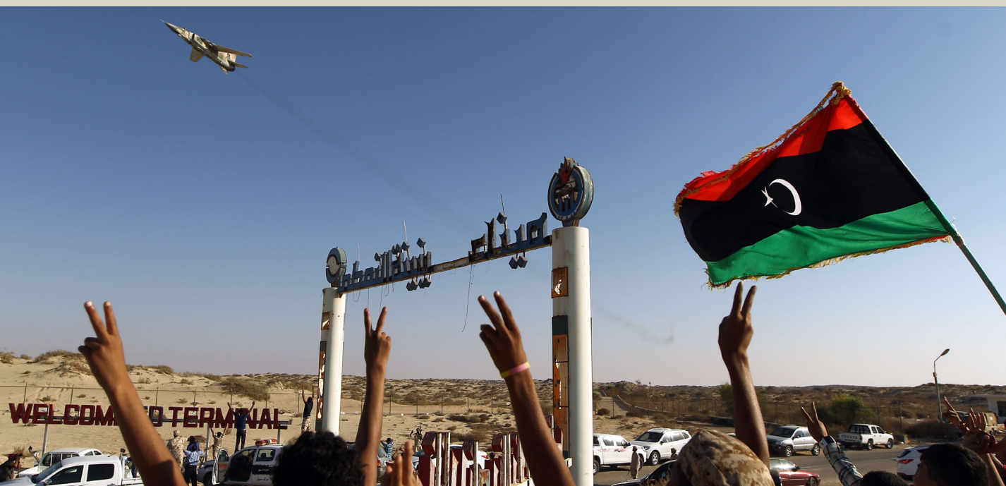
People gesture and wave a Libyan flag as a fighter jet flies by the Zueitina oil terminal on September 14, 2016

criticism. Accordingly, UN mediation resulted in the oil returning to NOC control. Libya's unified oil production and sales system has been a central factor in keeping the country from splitting apart, and any effort to grab it threatens to break civil accord more broadly.