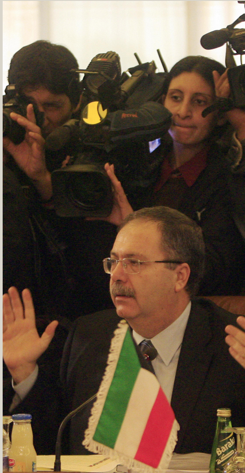
Tarek Mitri, then Lebanon's acting foreign minister, at a meeting of the Arab foreign ministers at Arab League headquarters in Cairo on January 6, 2008. From 2012 to 2014, Mitri served as the second head of the UN Support Mission in Libya.

Most Libyans appear to believe conflict is in neither their local nor the national interest. By 2015, regional actors recognized that