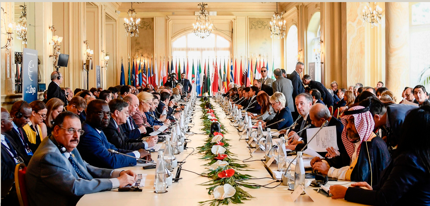
Heads of state, ministers, and special envoys attend an international conference on Libya at Villa Igia in Palermo, Italy on November 13, 2018.

For diplomatic efforts to produce results, internationals must work together to prevent any illegal oil exports, including by General Hifter and those with whom he is aligned, acting within the UN as needed to secure authorizations for measures to stop any such exports, if necessary on the high seas. The U.S. boarded and seized one such ship carrying oil that had been grabbed by easterners, the Morning Glory , with UN approval on March 17, 2014, and united action by the UN Security Council resulted in the deflagging by India and return to port of a