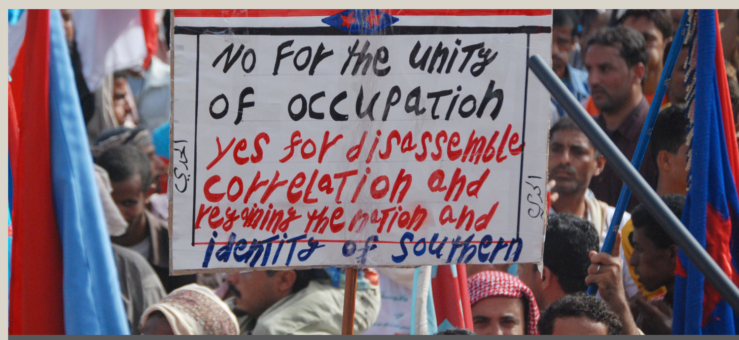
Waving the flag of the former South Yemen and holding banners, thousands rally in Yemen's main southern city of Aden, on May 21, 2014, demanding renewed independence for the region on the 20th anniversary of a secession bid that was crushed by northern troops.

As noted previously, Yemen's deep internal divisions have repeatedly led to eruptions of violence. At the same time, Yemenis have also repeatedly come together in an effort to find peaceful solutions to their differences. Common themes have linked all of the initiatives: recognizing the legitimate grievances of marginalized populations, promoting structural changes through constitutional reforms, ensuring regional political balances of power and