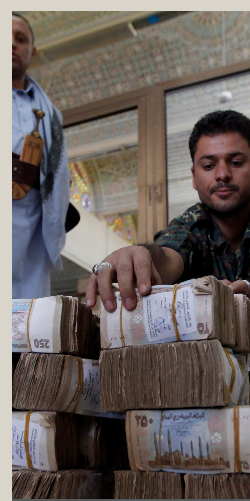
A member of the Shiite Houthi security forces arranges money donated by Houthi supporters to the rebel-controlled Central Bank of Yemen on September 27, 2016.

Undoubtedly, the most comprehensive attempt to end the cycle of violent conflict grew out of the Arab Spring revolt against the Saleh government and the resultant GCC Initiative-mandated NDC. While there has been criticism of the conference and it has been cast as a failure by many observers, the fact is that the NDC itself did not fail. The conferees, the most representative body to