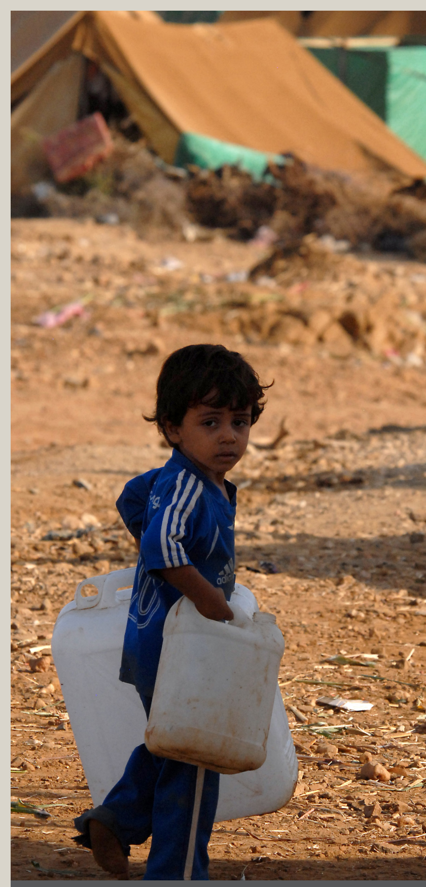
A displaced Yemeni child from the Sa'adah region carries jerry cans at the Mazraq IDP camp in northern Yemen on December 10, 2009.