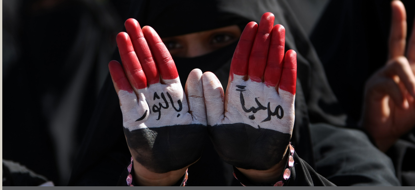
A Yemeni anti-government protester shows her hands, painted with the colors of the flag and the slogan 'Welcome revolutionaries,' during a demonstration in Sana'a on December 23, 2011 to reject an amnesty given to President Ali Abdullah Saleh in a deal that eases him out of office.

Within the Zaydi population, where the Houthis did not enjoy universal support, criticism of their movement often reflected this anti-sayyid, Qahtani viewpoint that interpreted the Houthi movement as antidemocratic and backward looking.