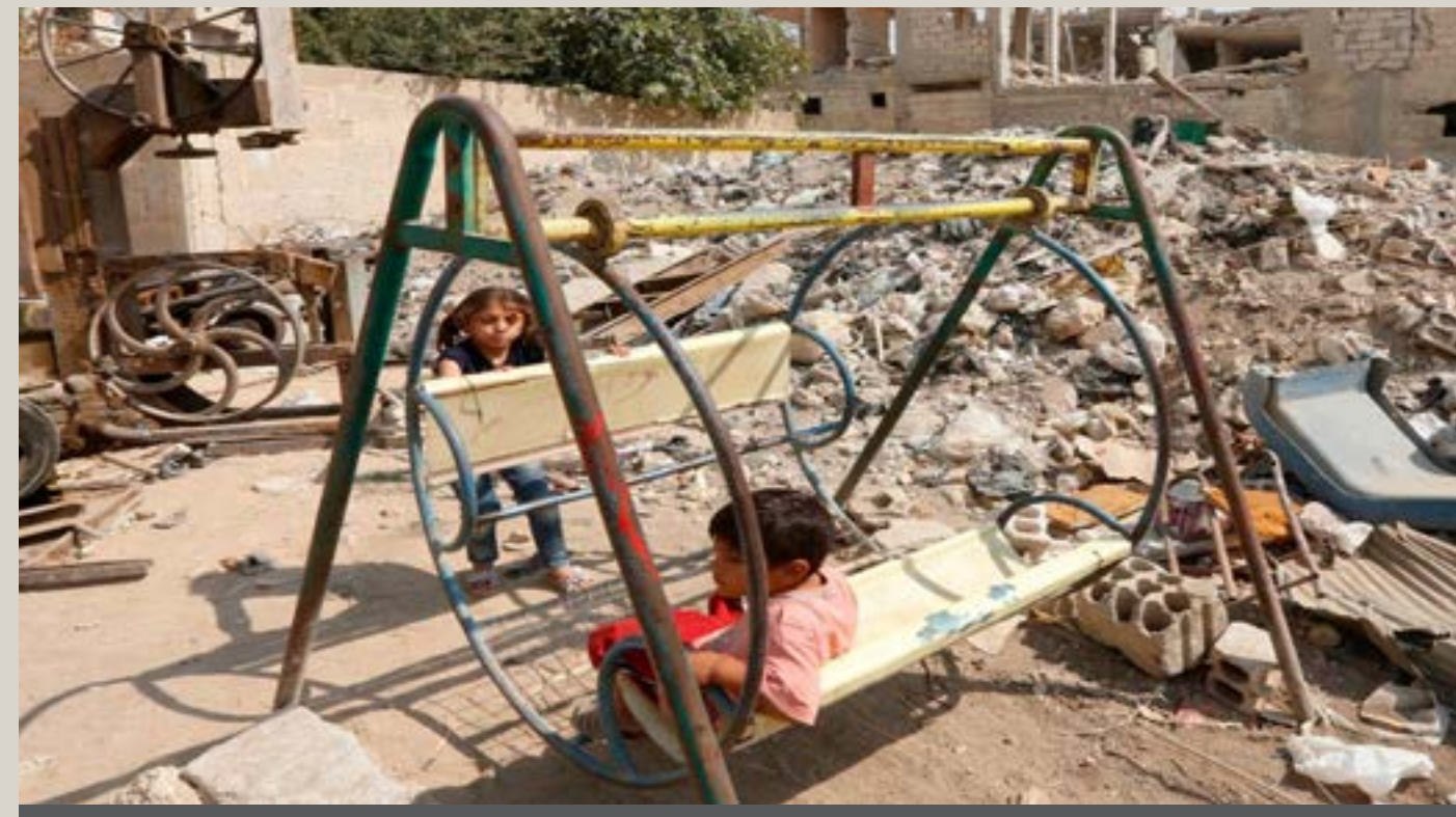
Syrian children play amid badly damaged buildings in Zabdin, in the East Ghouta region on the outskirts of Damascus, on October 8, 2018.

Staff: East Ghouta's hospitals are grossly understaffed, with few doctors available to operate the facilities. Specialized