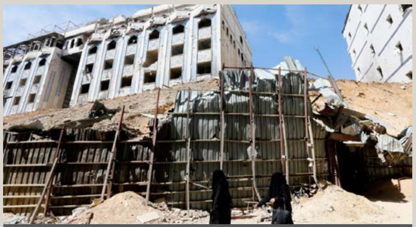
Syrian women walk past the entrance to an underground hospital in Douma on the outskirts of Damascus on April 16, 2018.