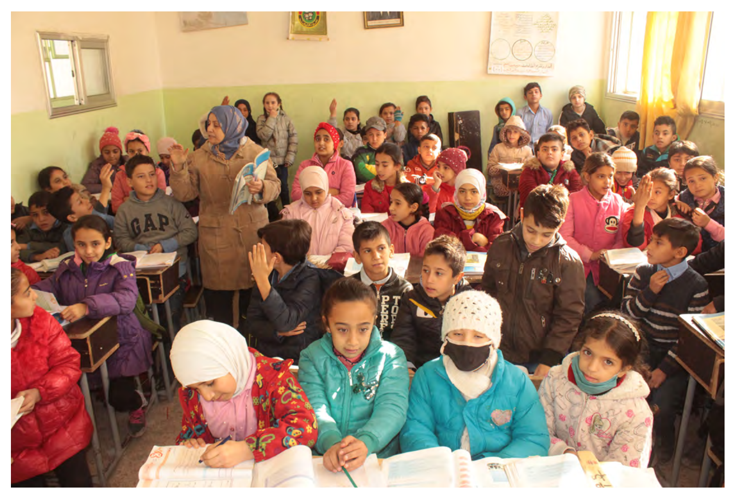
Photo above: Children are seen in a classroom in Hasakah Province in northeastern Syria on Nov. 19, 2020.

NES is characterized by large pockets of OOSC, with oversaturation of education service delivery in some formal camps for internally displaced persons (IDPs) using catch-up curriculum, while other informal settlements remain underserviced. 69 Several of the country's largest IDP camps are located within this region. Approximately 1.4 million children and youth are in need of education services in AANES.70 The various curricula taught (see Figure 1) designate the language of instruction for learners in AANES. As with NWS, lack of ageappropriate learning opportunities in NES has contributed to high rates of OOSC.71 Activities using a catch-up curriculum are administered in English and Arabic, but authorities in AANES implement their own curricula in Kurdish<sup>72</sup> as well as in the Syriac language. 73 There is anecdotal evidence that administering Kurdish curricula in AANES has pushed some parents to move to the GoS-held part of al-Hasakah province in order to access the recognized, Arabic-language GoS