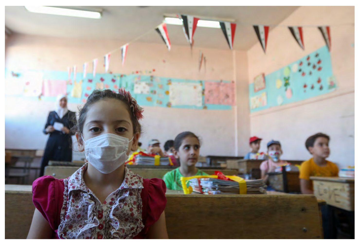
Photo above: Syrian pupils take their seats in class in the capital Damascus on Sept. 13, 2020, during the first day of the school year.