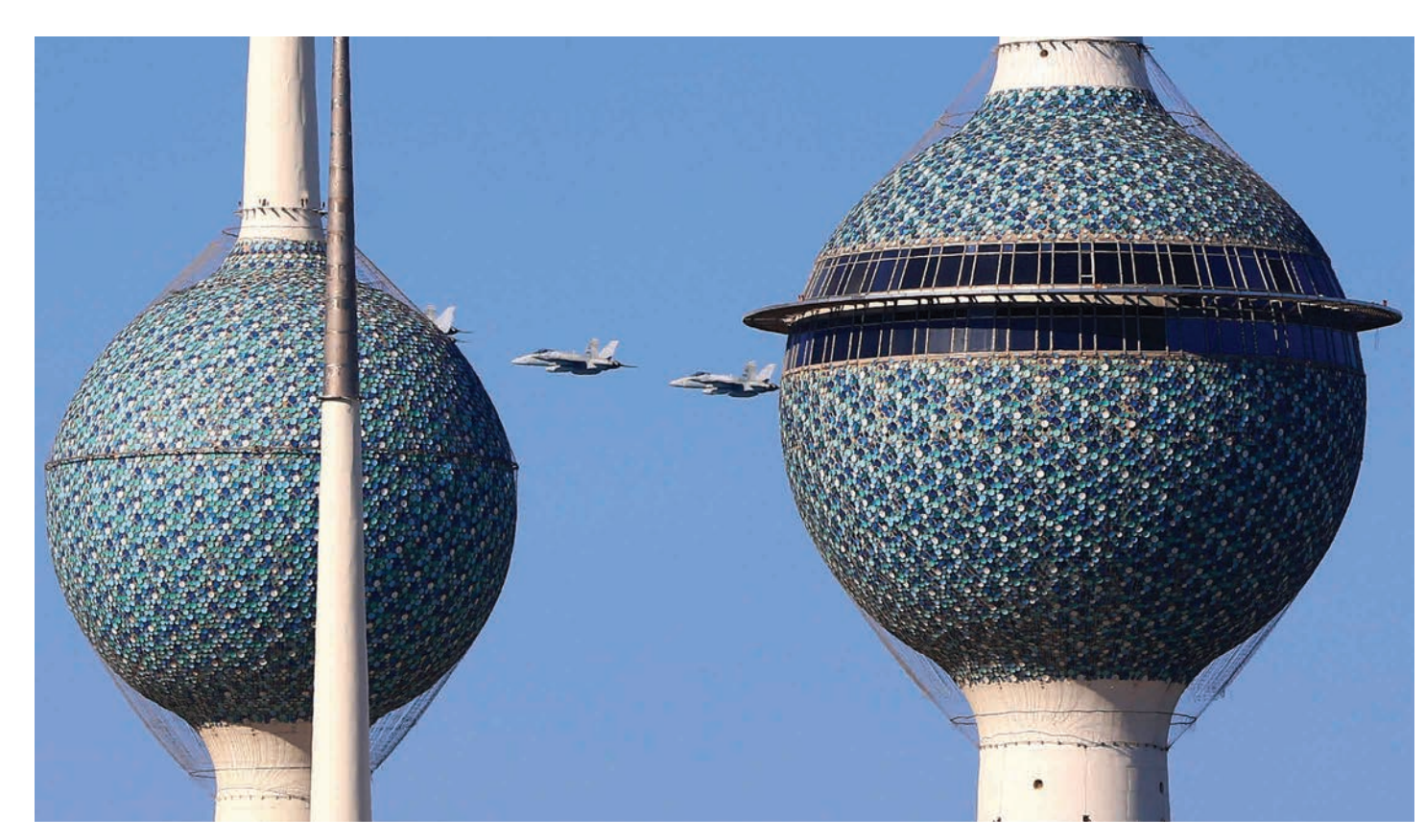
Photo above: Kuwaiti Air Force pilots show their skills near the Kuwait Towers, during the launching ceremony of the Hala shopping festival, in Kuwait City on Jan. 29, 2016.

"It is definitely not enough for the U.S. and Kuwait to keep doing what they're doing and expect the security relationship to mature and cooperation to truly reach the next level."