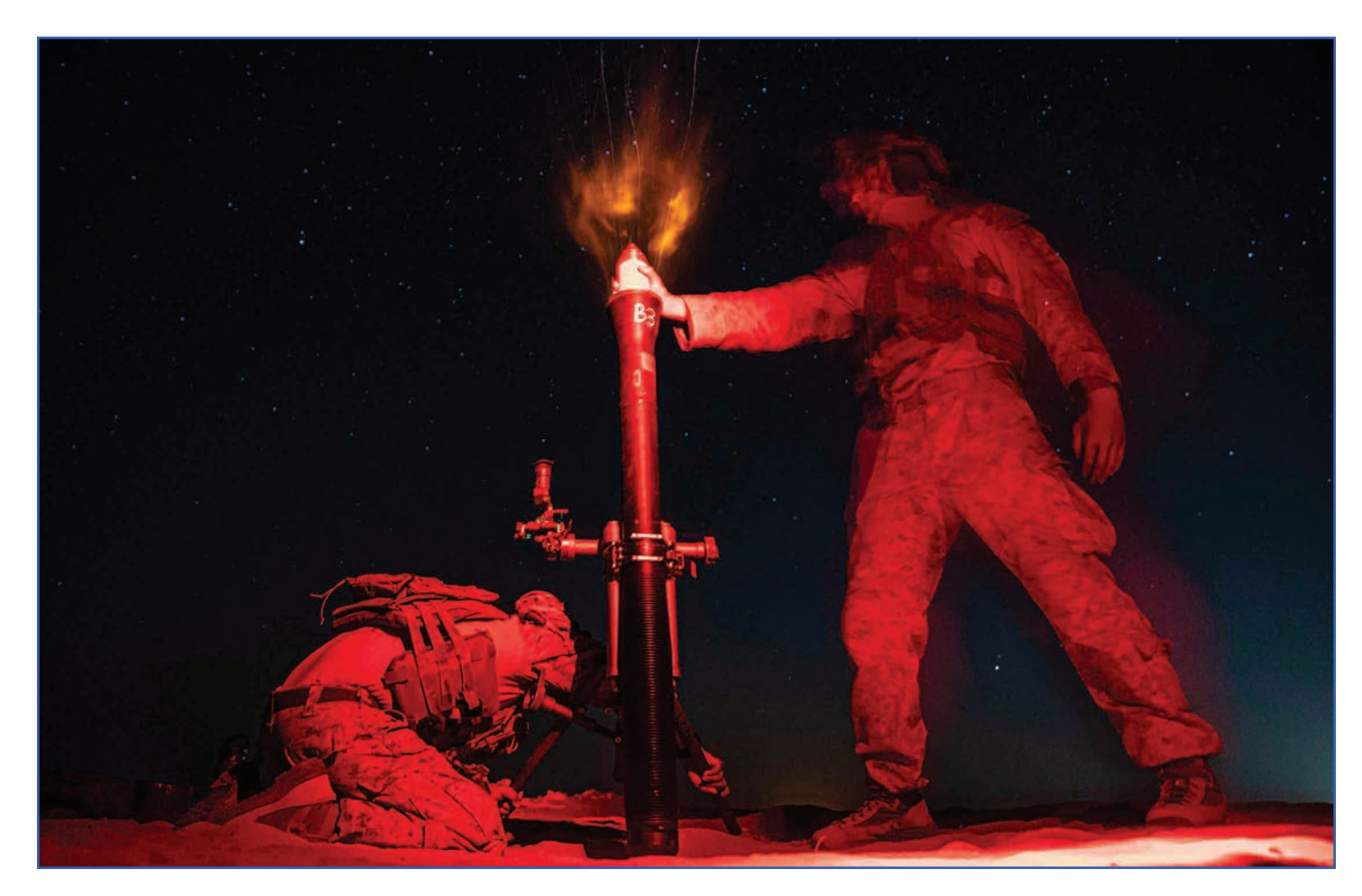
Photo above: U.S. Marines practice firing an M252A2 81 mm mortar system during a night live-fire exercise at Camp Buehring, Kuwait, Oct. 3, 2021.