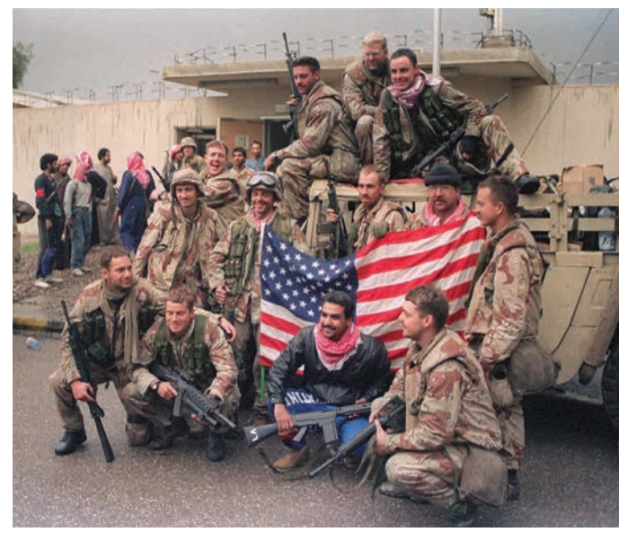
Photo above: Several members of the U.S. Special forces holding a U.S. flag celebrate their victory over the Iraqi army on Feb. 27, 1991, in Kuwait City.