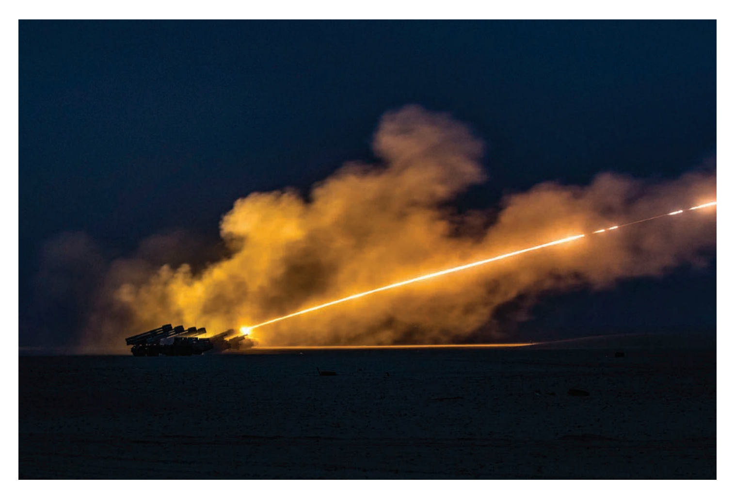
Photo above: U.S. and Kuwaiti soldiers fire mobile artillery rockets during a joint live-fire exercise near Camp Buehring in Kuwait, Jan. 8, 2019.

Since Operation Desert Storm in 1991, Kuwait has financially compensated the United States for maintaining forces on its soil. The Kuwaiti government, unlike most others in the region and around the world that are partnered with Washington, does not charge for the use of Kuwaiti land, and it offers the United States a very cheap rate for electricity and other utilities. Among other financial contributions to various U.S. military operations in the region, Kuwait has supplied the United States with approximately $200 million per year to help it contain and stabilize Iraq. And during and after Desert Storm, Kuwait paid the United States roughly $16 billion to offset U.S. war costs. Last but not least, Kuwait gave free plane rides to dozens of American evacuees from Afghanistan, sending them back home on Kuwaiti Boeing 777s.