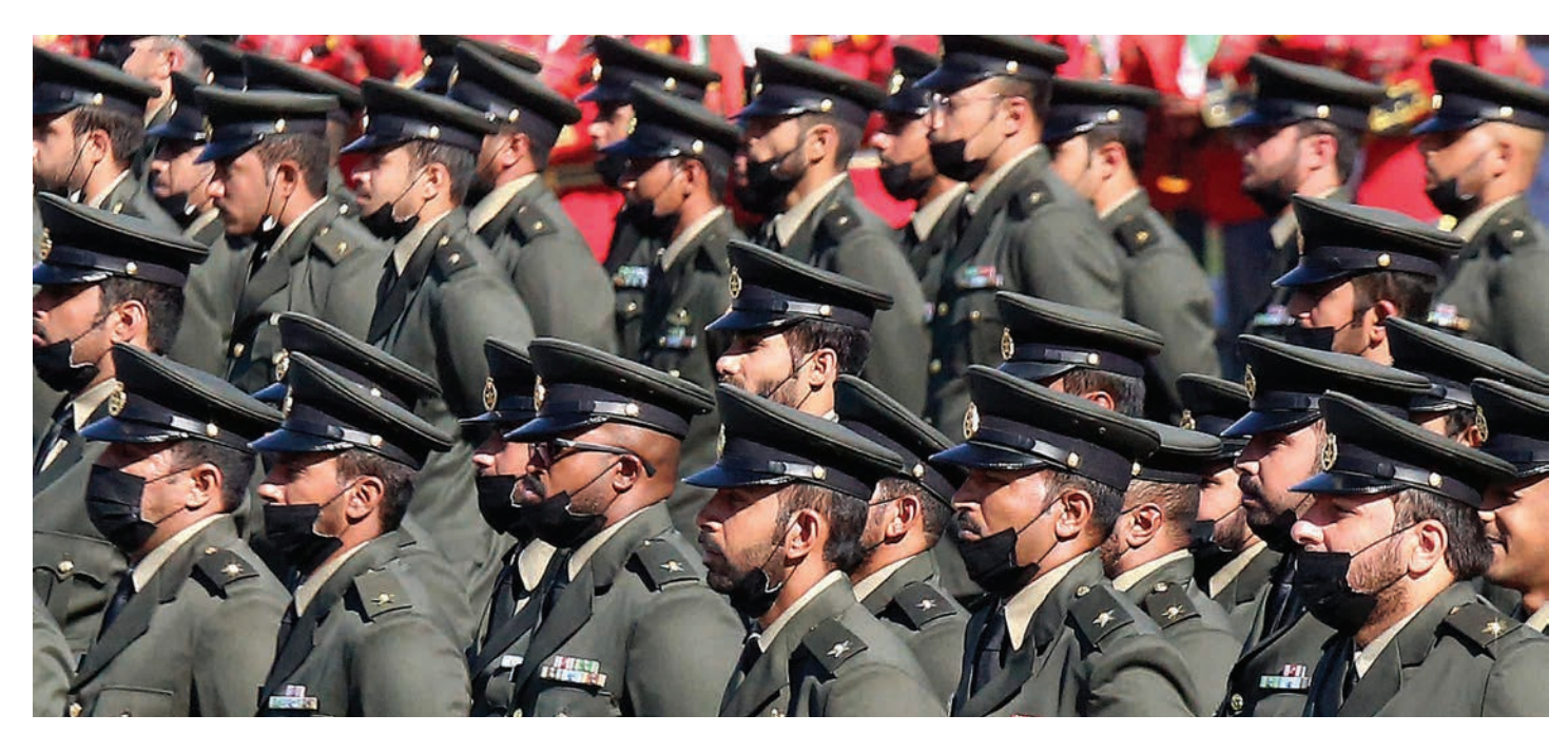
Photo above: Kuwaiti servicemen perform during a graduation ceremony for army officers, at Ali Al Sabah Military College in Kuwait City on Feb. 9, 2022.

All of this data remains vastly insufficient to comprehensively assess the KAF. The Kuwaitis don't fully know their strengths and weaknesses, nor do the Americans, because they haven't gone to battle for a very long time. They also don't "taskorganize" for combat, which means they don't group their forces in a certain way to accomplish a particular mission; nor do they allocate available assets to subordinate commanders and establish their command and support relationships. While it is difficult to analyze Kuwait's military effectiveness, it is possible to assess the country's defense institutional capacity — in other words, the strategic, institutional, organizational, and programmatic fabric of its national defense establishment. That's quite a useful and necessary exercise because there's an important, if not direct, relationship