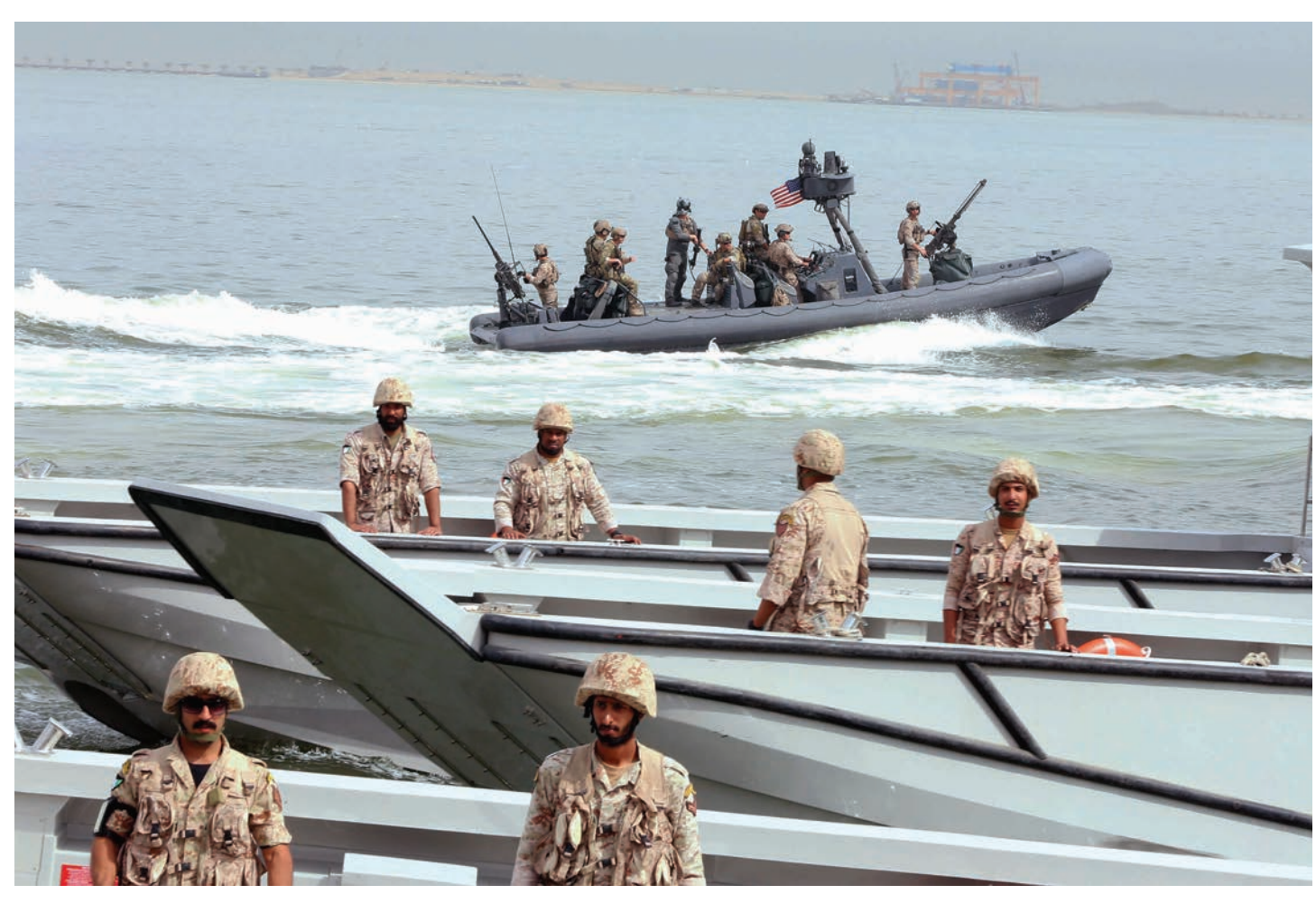
Photo above: Soldiers from the United States, Kuwait, and other Gulf Cooperation Council countries participate in the concluding drill of the wide-scale Eagle Resolve 2017 military exercise at Shuwaikh Port, west of Kuwait City on Apr. 6, 2017.

2021 joint chemical, biological, radiological, and nuclear decontamination training with U.S. Navy Explosive Ordnance Disposal technicians.