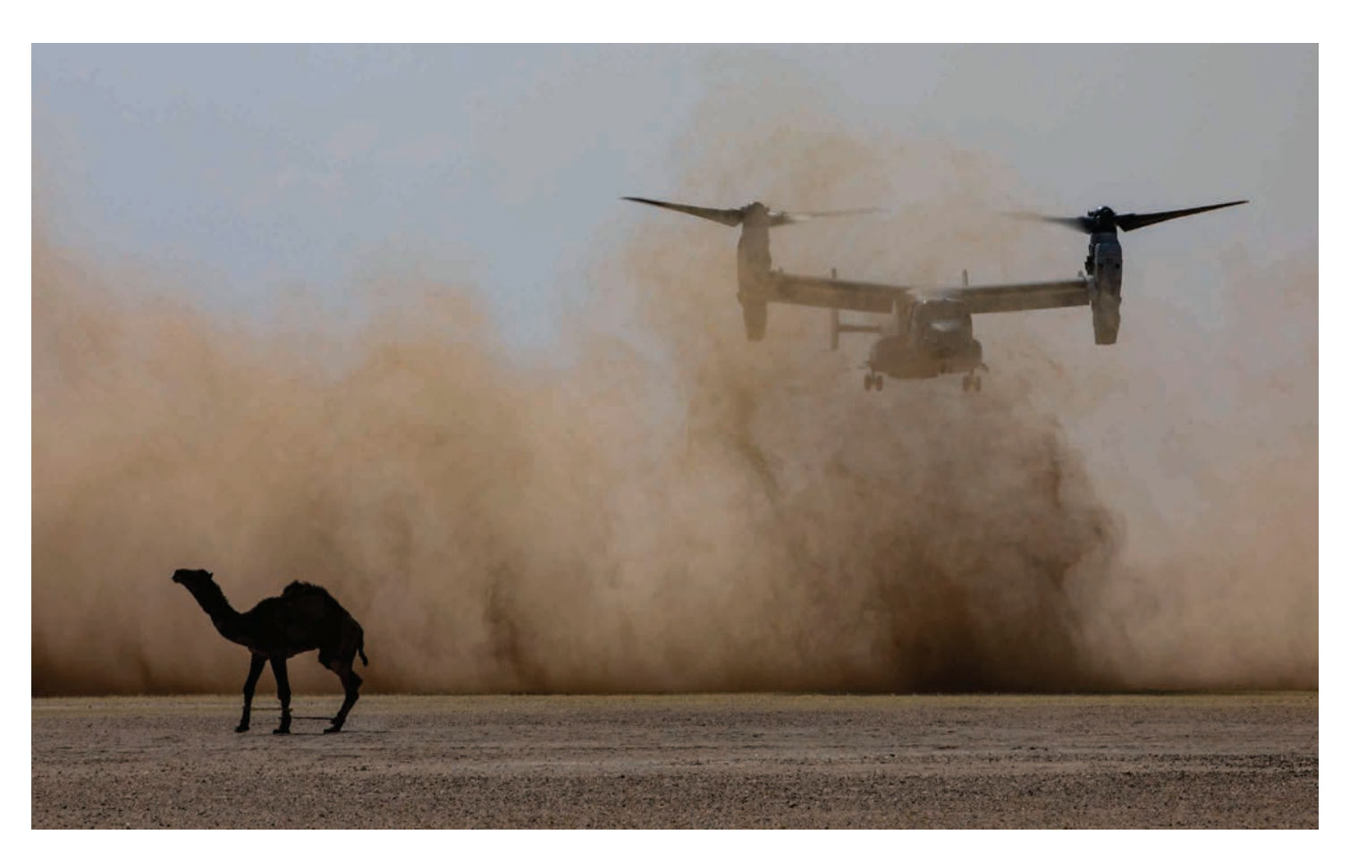
Photo above: A Marine Corps MV-22 Osprey prepares to land during embassy reinforcement training at Camp Buehring, Kuwait, Apr. 12, 2019.

We don't need two divisions of tanks stationed in Kuwait, just like we don't need a brigade combat team and two fighter squadrons in the country. The Kuwaitis have enough firepower of their own. What we need is tailored and more consistent U.S. advice on defense governance and, specifically, on how to create a Kuwaiti joint force.