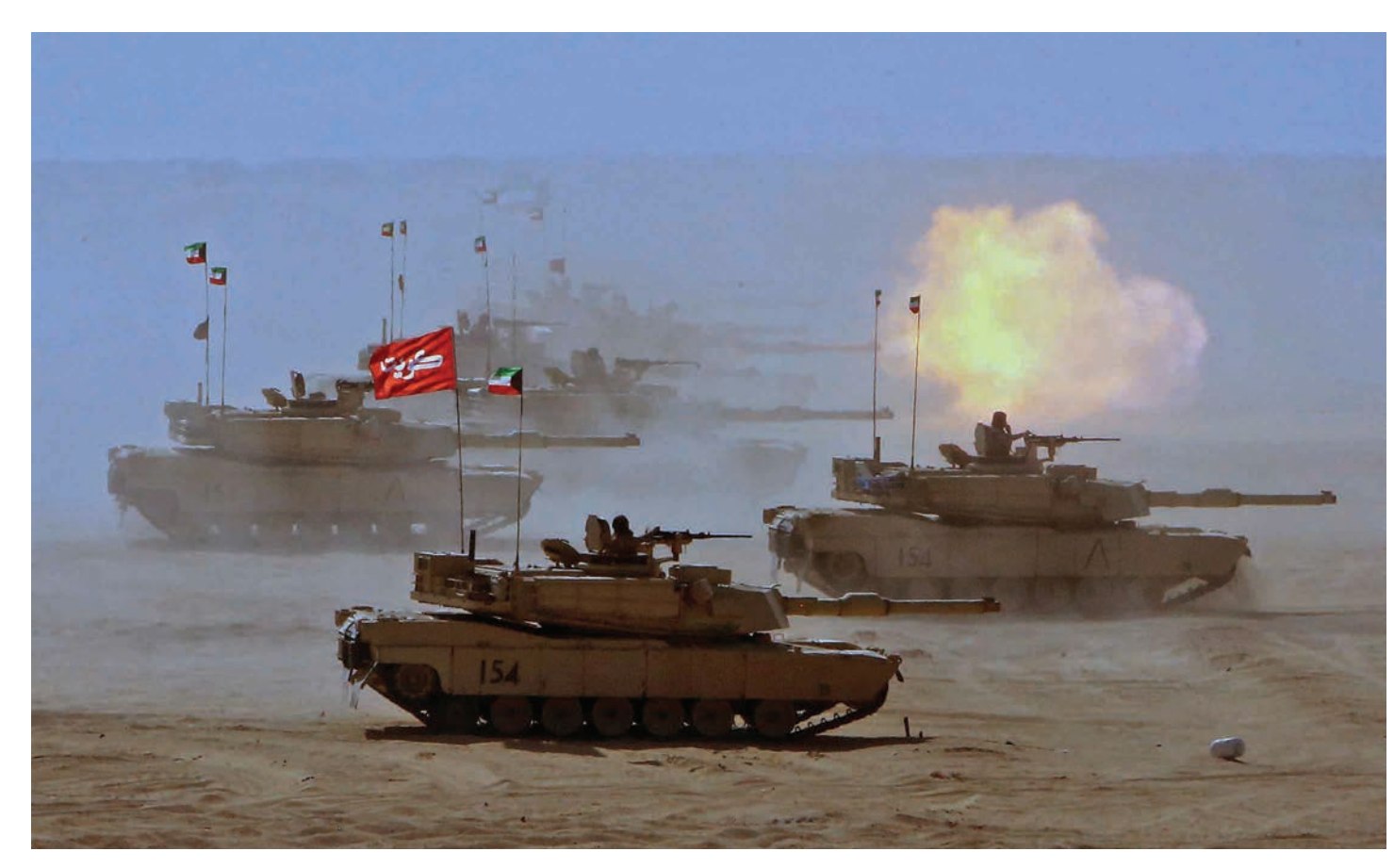
Photo above: Kuwaiti, Saudi, and U.S. land forces take part in the Gulf Gunnery 2021 exercise at the Udaira military range.

"During Operation Iraqi Freedom in 2003, Kuwait provided up to 60% of its territory for coalition use."