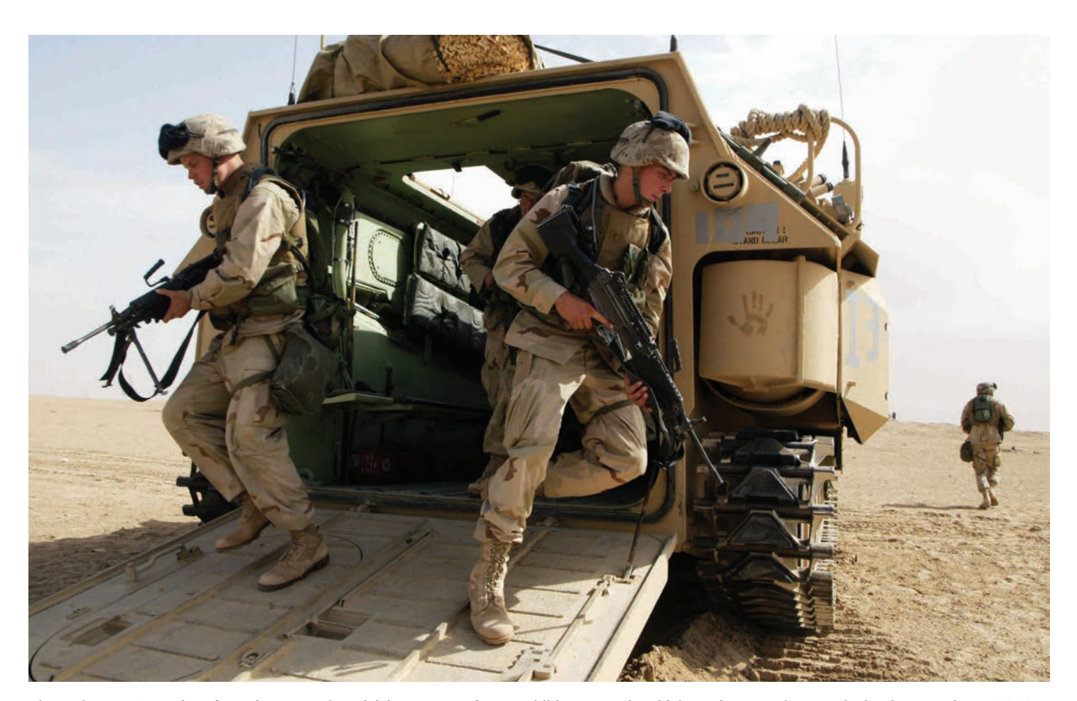
Photo above: U.S. Marines from the 1st Marine Division run out of an amphibious assault vehicle as they practice trench clearing on Feb. 15, 2003, near the Iraqi border in Kuwait.

Security cooperation between the United States and Kuwait is not limited to U.S. basing and the above-mentioned military activities and training exercises. Like other wealthy Gulf Arab nations, the Kuwaitis buy a healthy amount of weapons from the United States (though less than the Saudis or the Emiratis)