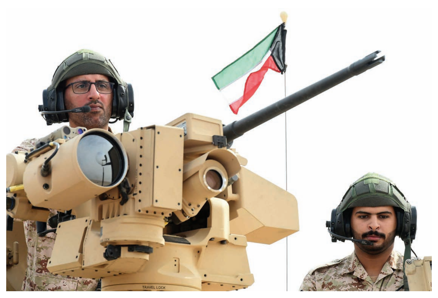
Photo above: Soldiers wait to participate in a military drill in Jahra Governorate, Kuwait, on Dec. 2, 2021.

Luckily for Washington, Kuwait is not one of those apprehensive or hesitant partners. Of course, this does not mean that the Kuwaitis have no issues at all with Washington or don't ever question U.S. policy; but the trust they have in the United States is unmatched among Arab partners. Maybe it's because the Kuwaitis recognize they don't have better security options. Or maybe they're eternally grateful to the Americans for liberating their country from Iraqi occupation. The reasons for this mutual, deep trust are less important. What matters most is that Kuwait is all in when it comes to the security partnership with the United States. This is quite important for Washington, and CENTCOM in particular, because contrary to conventional wisdom, Kuwait has a lot to offer, some of which is unique in the region.